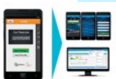
CitiDirect BE® Aplikacja MobilePASS